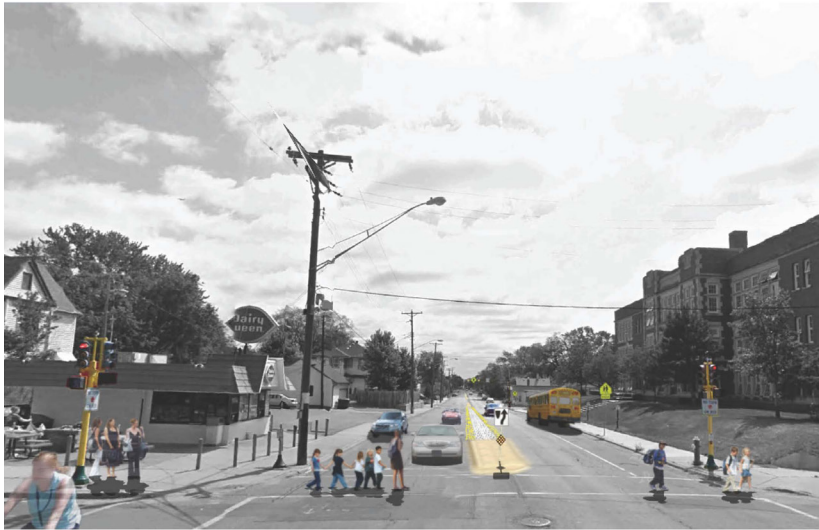
Median Material: Duratherm