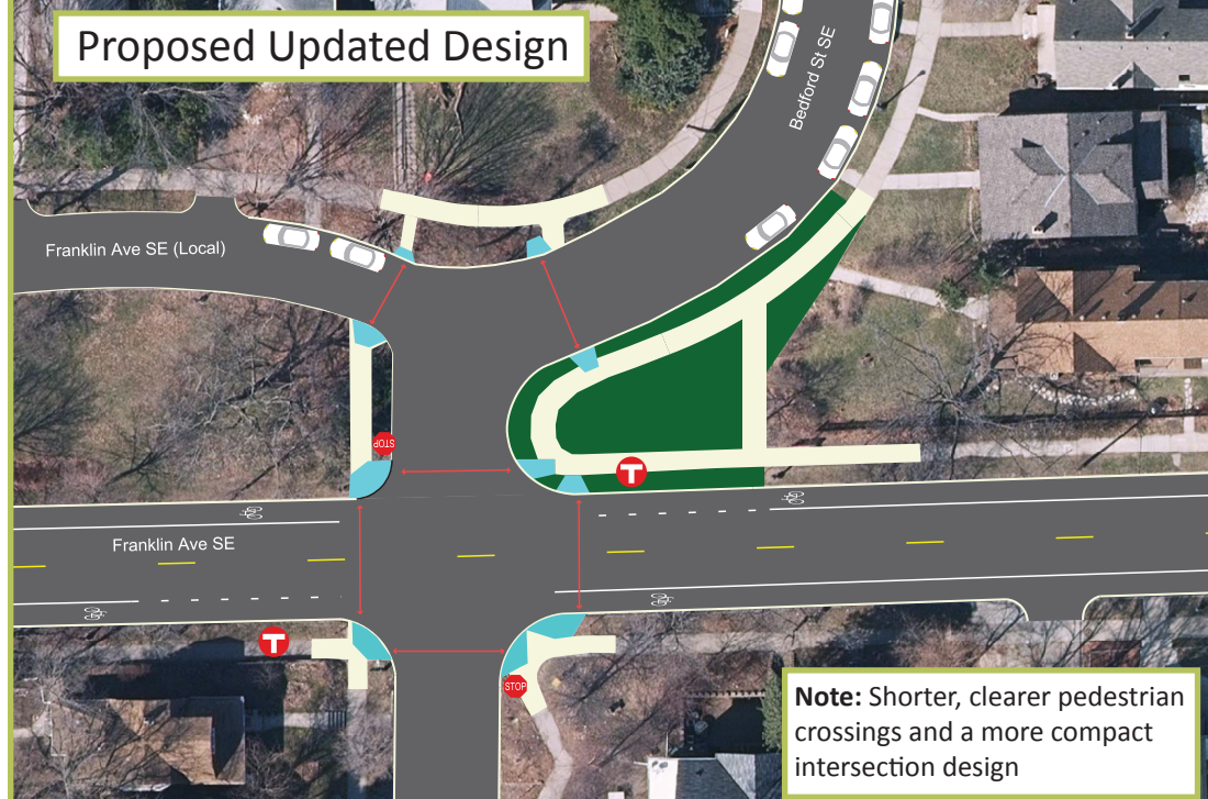
Note: Concepts are for illustrative purposes only

Concrete Sidewalk ADA Ramp Pedestrian Crossings