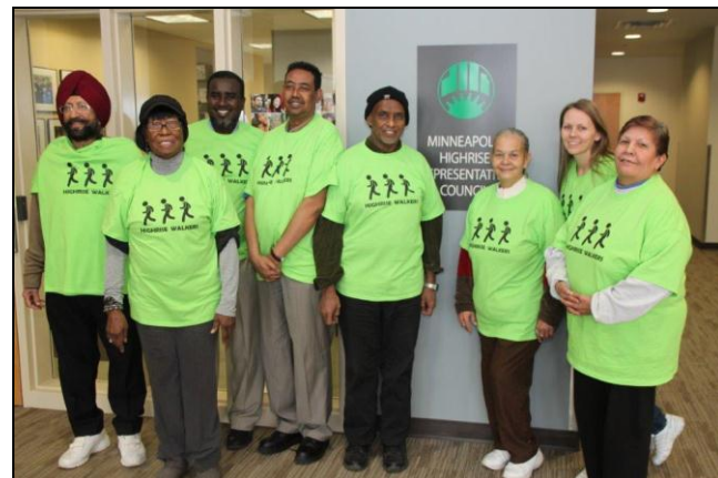
Members of the Active Living Advisory Committee

As part of its Healthy Living initiative, the Minneapolis Health Department has been working with residents of Minneapolis Public Housing Authority highrise buildings to improve physical activity opportunities in and near the highrises. The Health Department is working on this project in partnership with the Minneapolis Highrise Representative Council (MHRC), the MPHA highrise tenant organization. Together, MHRC and the Health Department have led a process to gather resident input on exercise equipment in their buildings, falls prevention programming, and the walking environment around their buildings. MHRC and the Health Department worked with the Active Living Advisory Committee to develop a process to assess the walking environment around buildings. Advisory committee members included eight highrise residents, a representative from Allina Health, representatives from Volunteers of America (an organization that provides social workers in highrise buildings), Minneapolis Public Works staff, Health Department staff, and MHRC staff.