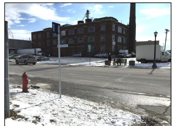
Dupont Ave N and Glenwood Ave N: Traffic traveling on Glenwood Ave N does not have a stop sign, and residents find it difficult to cross the street to get to the bus stop.