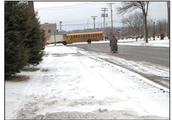
A resident using a walker walks in the street to avoid an unshoveled sidewalk on Dupont Ave N near Heritage Commons at Pond's Edge

Health Department staff, MHRC staff and residents plan to share the findings with the appropriate agencies and policymakers in order to see how these concerns can be addressed, either in the near term or through future infrastructure projects or planning efforts. After participating in walking audits, residents at many of the buildings began to walk more often, and residents at several buildings started walking clubs. These walking audits have become part of a larger movement among residents to lead active, healthy lifestyle.