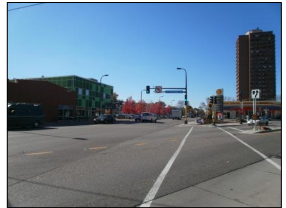
E Franklin Ave & Riverside Ave: Traffic signal with green arrow for right turns is confusing for crossing pedestrians; the wide intersection is also intimidating.