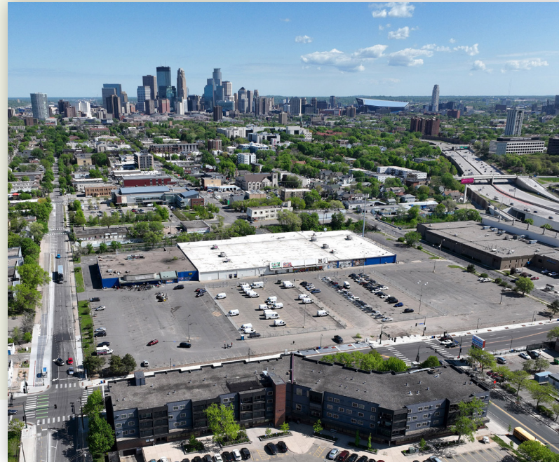
Aerial image of project site, May 2022

Today, the City owns this site again, and plans to construct Nicollet Avenue to reconnect with Lake Street. With community input, the site will once again serve as a commercial and cultural crossroads, reflecting the needs of the community who currently lives here.