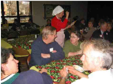
Figure 1: CARAG's annual Chilly Chili Fest event.

Project Description: Dormant Strategy. The CARAG NRP Full Action Plan describes using funds to increase the number of trees along Bryant and Hennepin Avenues, which do not have boulevards. However, NRP funds may only be used to plant trees in the public right of way, and the sidewalks on these streets are relatively narrow.