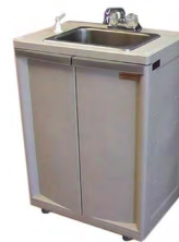
Mobile Hand Washing Sink