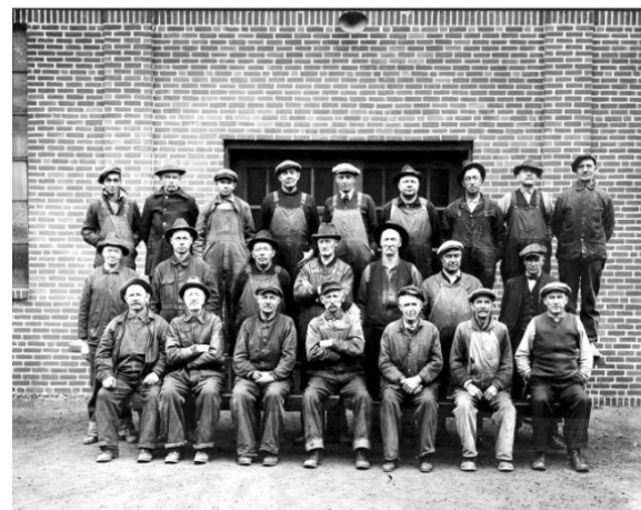
City of Minneapolis East Water Dept Early 1900's