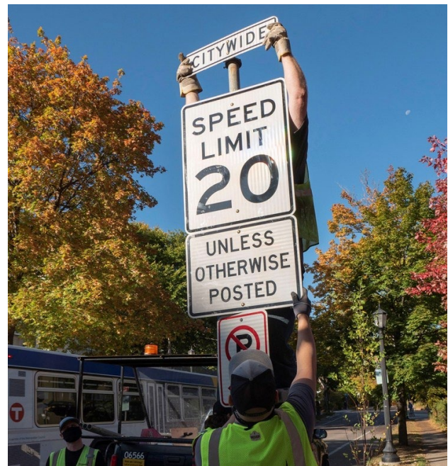
City of Minneapolis lowers speed limit of most residential streets to 20mph.

The City of Minneapolis looks forward to working with other local governments, strengthening and expanding collaboration with partner organizations, and continuing to engage and learn from older residents as we work together to make our city a place where we can all thrive in later life.