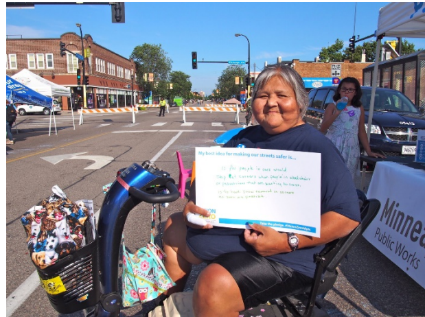
Minneapolis recently reduced speed limits on city-owned streets to make streets safer for pedestrians and drivers of all ages.

Major win for: Health & Wellness , Housing