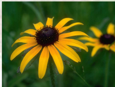
Black Eyed Susan

Butterfly Milkweed Lance-leaved Tickseed Purple Coneflower Blue Flag Iris Blue Lobelia Horsemint Mountain Mint Prairie Spiderwort