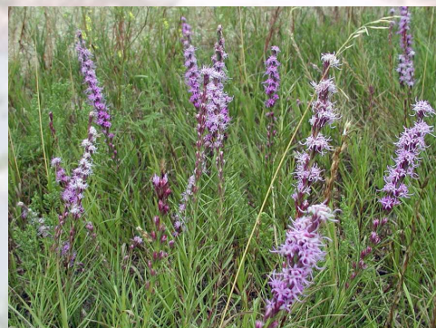
Dotted Blazing Star