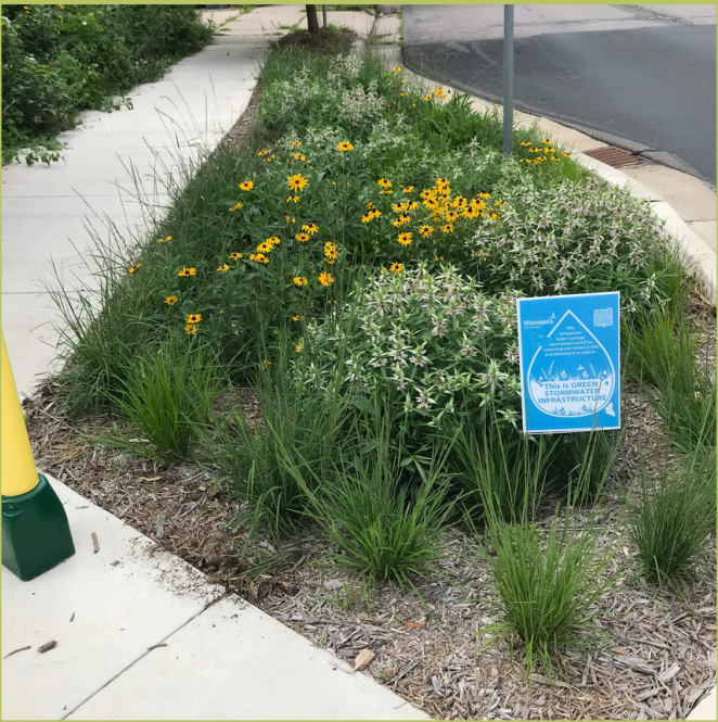
Rain garden basin on Grand Avenue, restored 2024

Questions or concerns? Call 311 or email waterresources@minneapolismn.gov