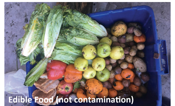
Edible Food (not contamination) (edible food refers to whole, uneaten pieces of food like fruits, vegetables, meat, and bread, that could have been eaten instead of disposed of)