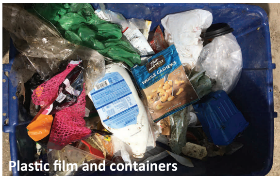
Plastic film and containers (plastic produce bags, zip-seal bags, pizza sauce cups still inside delivery boxes, clamshells, silverware, yogurt cups, pouches, jugs, foam)