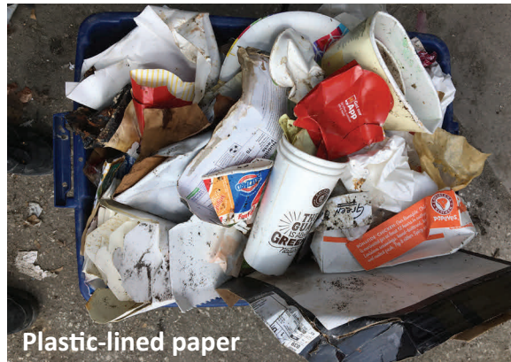
Plastic-lined paper (fast food cups, coffee cups, food wrappers, shiny paper plates, Chinese take-out cartons)