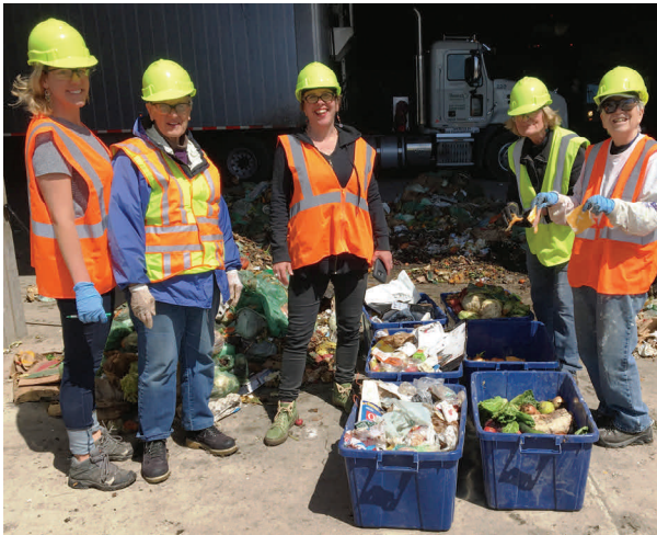
Sort photos taken from April 2018 sorts