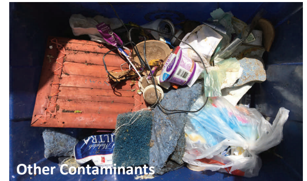
Other Contaminants (diapers, 1 wool sweater not cut up into small squares, 3 full yogurt containers, 1 bag of trash, a few aluminum cans, pieces wood, yard waste, 3 pieces metal silverware, electric cord)