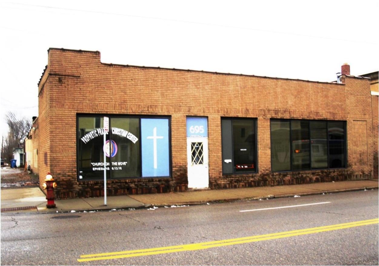
Exterior of 695 at corner of Lowry Ave NE and Howard Ave NE