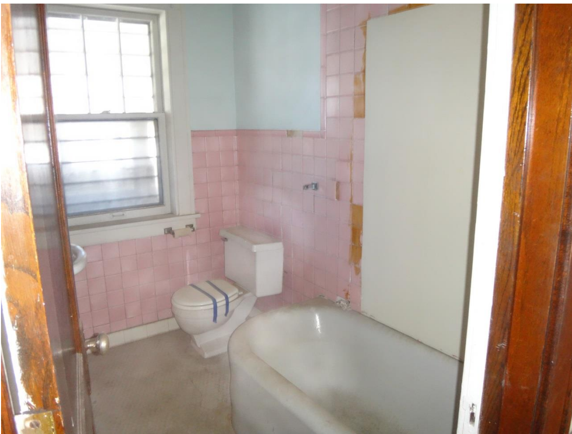
Second story apartment bathroom, 699 Lowry Ave NE