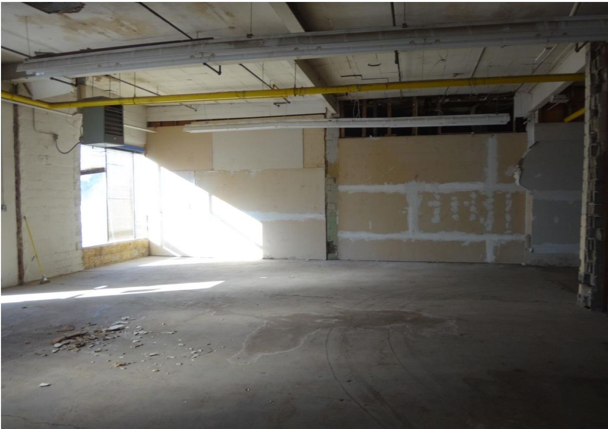
Center commercial space, 695 Lowry Ave NE, window facing Lowry