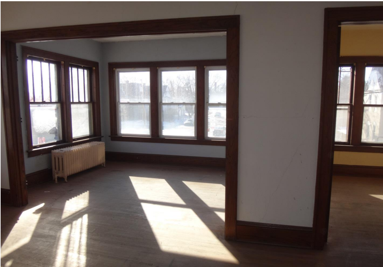
View of sunroom and bedroom in second story apartment, 699 Lowry Ave NE, windows facing Lowry