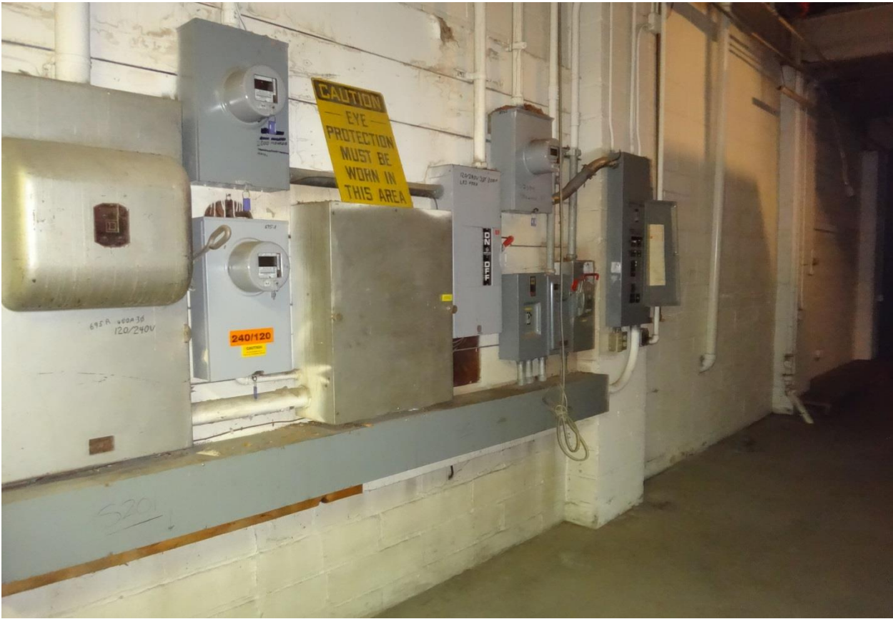
Utility panels, 695 Lowry Ave NE