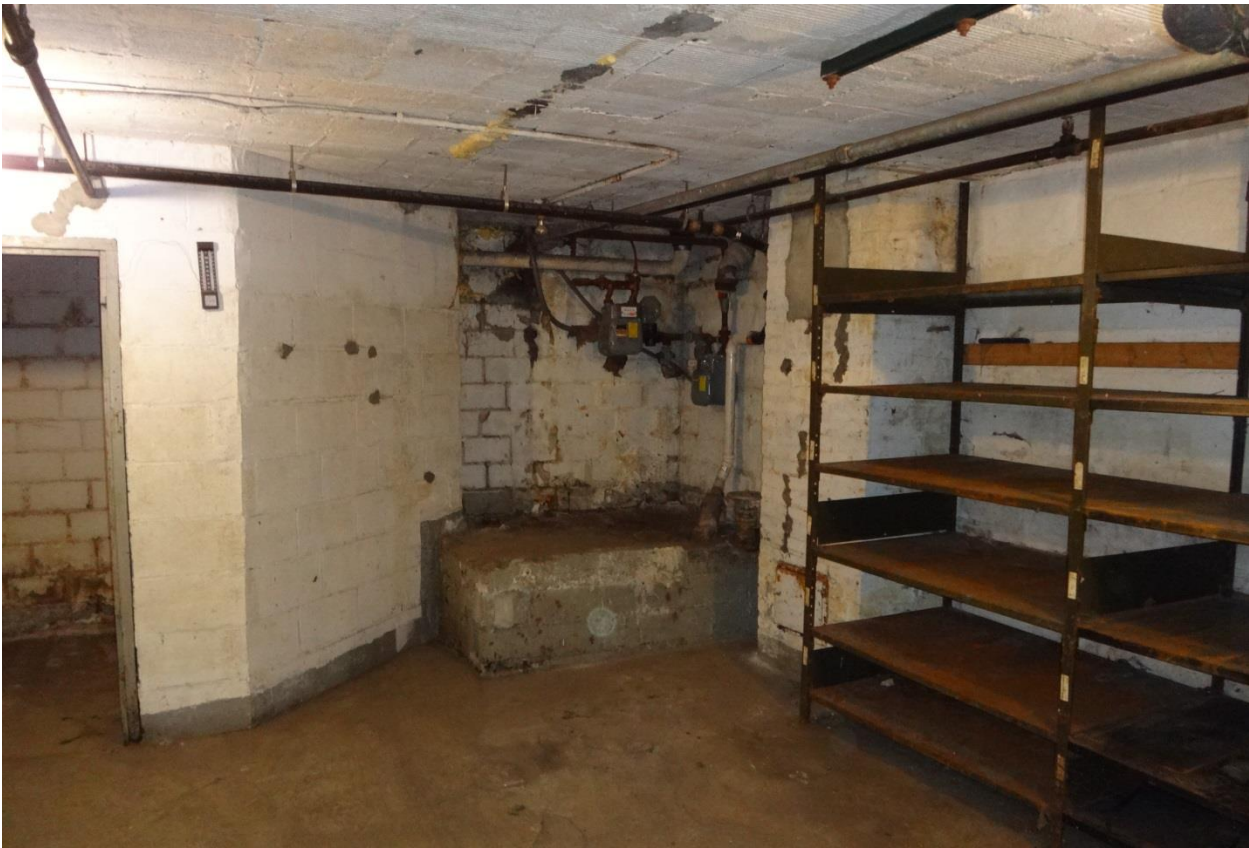
Mechanicals basement of 695 Lowry Ave NE