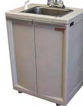
Mobile Hand Washing Sink