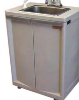
Mobile Hand Washing Sink