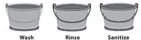
Utensil Washing Setup

Failure to comply with these guidelines can result in a citation, closure of food booth, or denial of future permits.