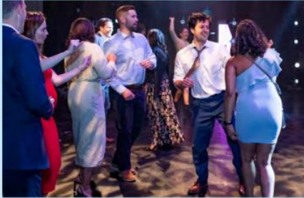
Onstage danceparty at DecaDANCE 2022