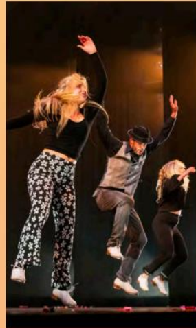
Rhythm Street Movement