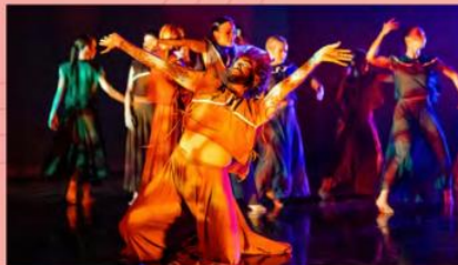
Crash Dance Productions