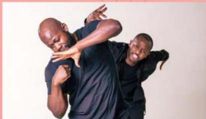
Atlantis13

2022 meant another full calendar year for The Cowles Center! Celebrating our 12th season this past year, we featured the largest number of choreographers in recent history and paid out over $35,000 in commissions for new work. The Cowles Center has served the dance community for a little over a decade establishing itself as an important part of the Minnesota dance community. At The Cowles Center, we intend to further highlight and nurture artists, learners, and audiences alike that breathe life into the building.