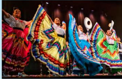
Ballet Folklorico Mexico Azteca at DecaDANCE 2022